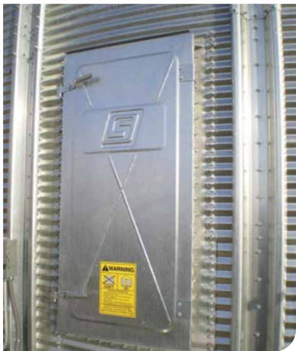
Walk-in-doors have welded frames, reinforced outer door panel and three hinged inner flaps with positive locking bars. A heavy-duty version is also available on stiffened bins/silos.