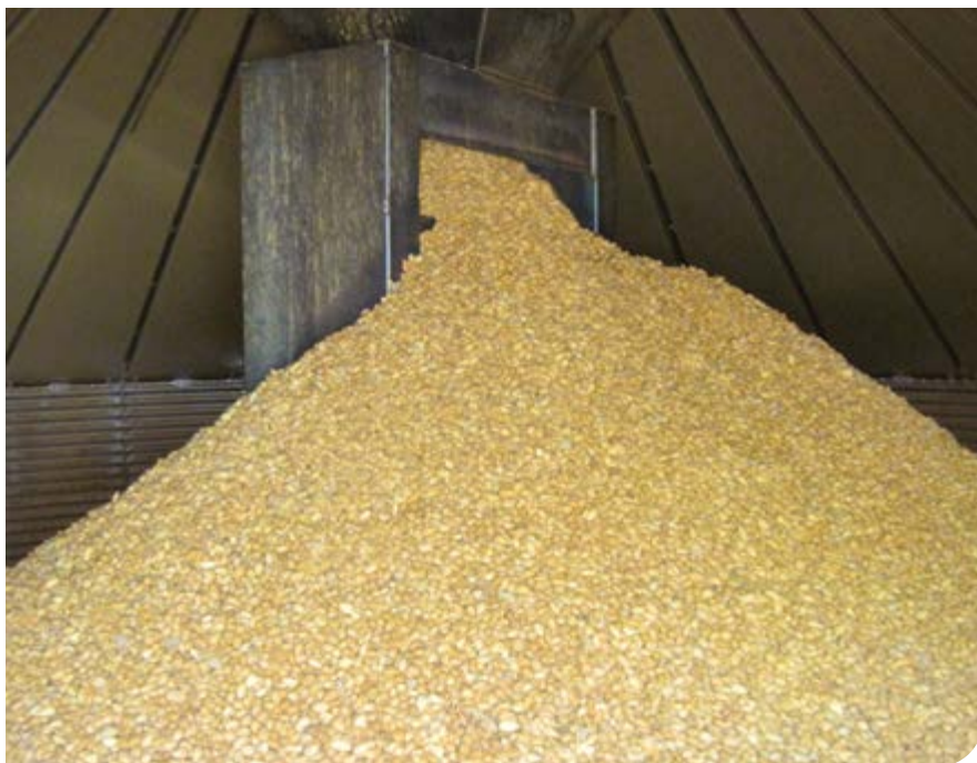
Let-down ladder evenly distributes stored product throughout the bin/silos.