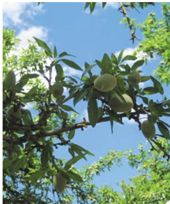
Protect your high value harvest/investment with SCAFCO storage solutions.