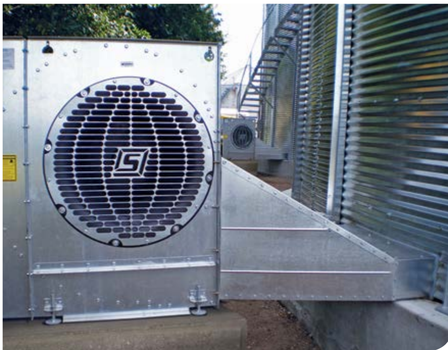
Centrifugal fans provide adequate airflow capacity to minimize or prevent product deterioration and spoilage.