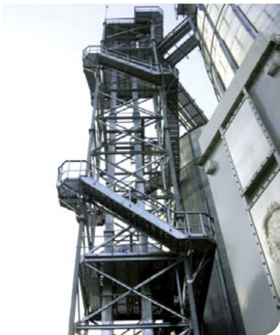
Elevator support tower designed complete with integral spiral stairway and platforms.