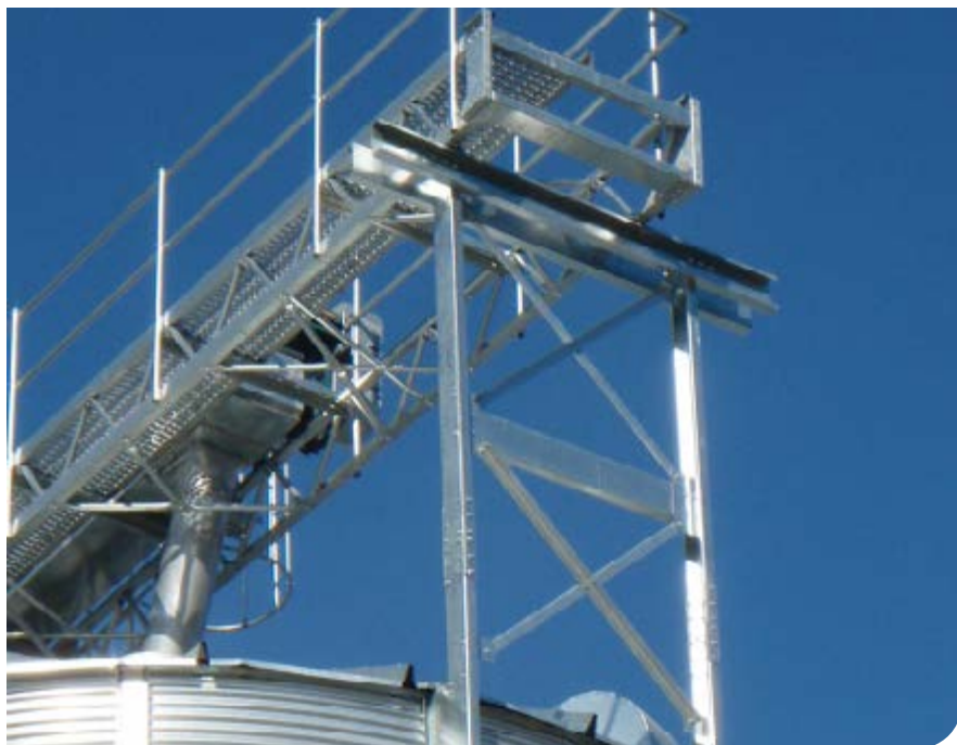
Catwalks can be designed to support conveyors of various widths. Walkways can be supplied with structural bar grating or cold formed slip resistant decking.