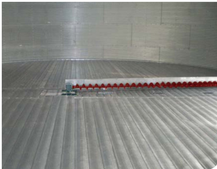
Full perforated plank floors allow for drying or conditioning and to distribute air evenly up through the stored product.