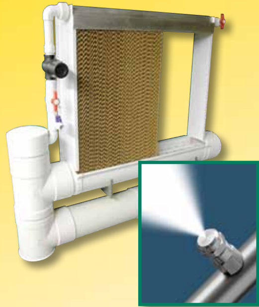
Effective evaporative cooling using pad or ultra-high pressure pad-free systems