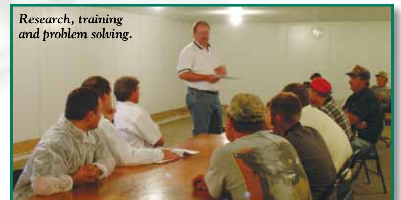
Research, training and problem solving.

Our results are improving your environmental controls, ventilation, cooling and heating, feeding, and watering systems. Besides developing innovative new products, we are committed to sharing technical information with you through training and printed materials. That's the way we work, that's the way we learn.