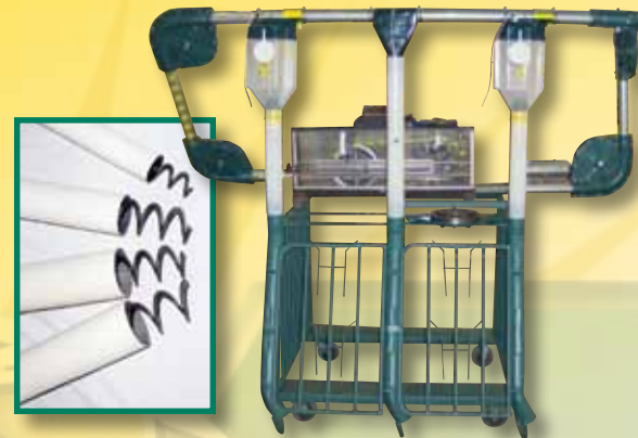
Feed delivery options for all phases of growth