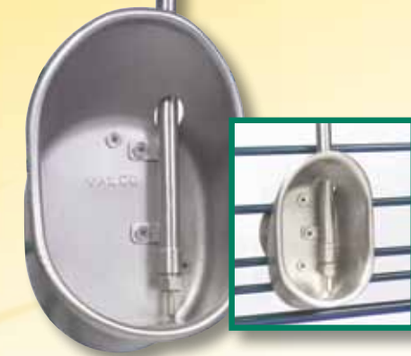
Hog drinking cups that reduce spillage by as much as 40%