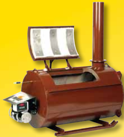
Cremators that save up to 65% fuel consumption