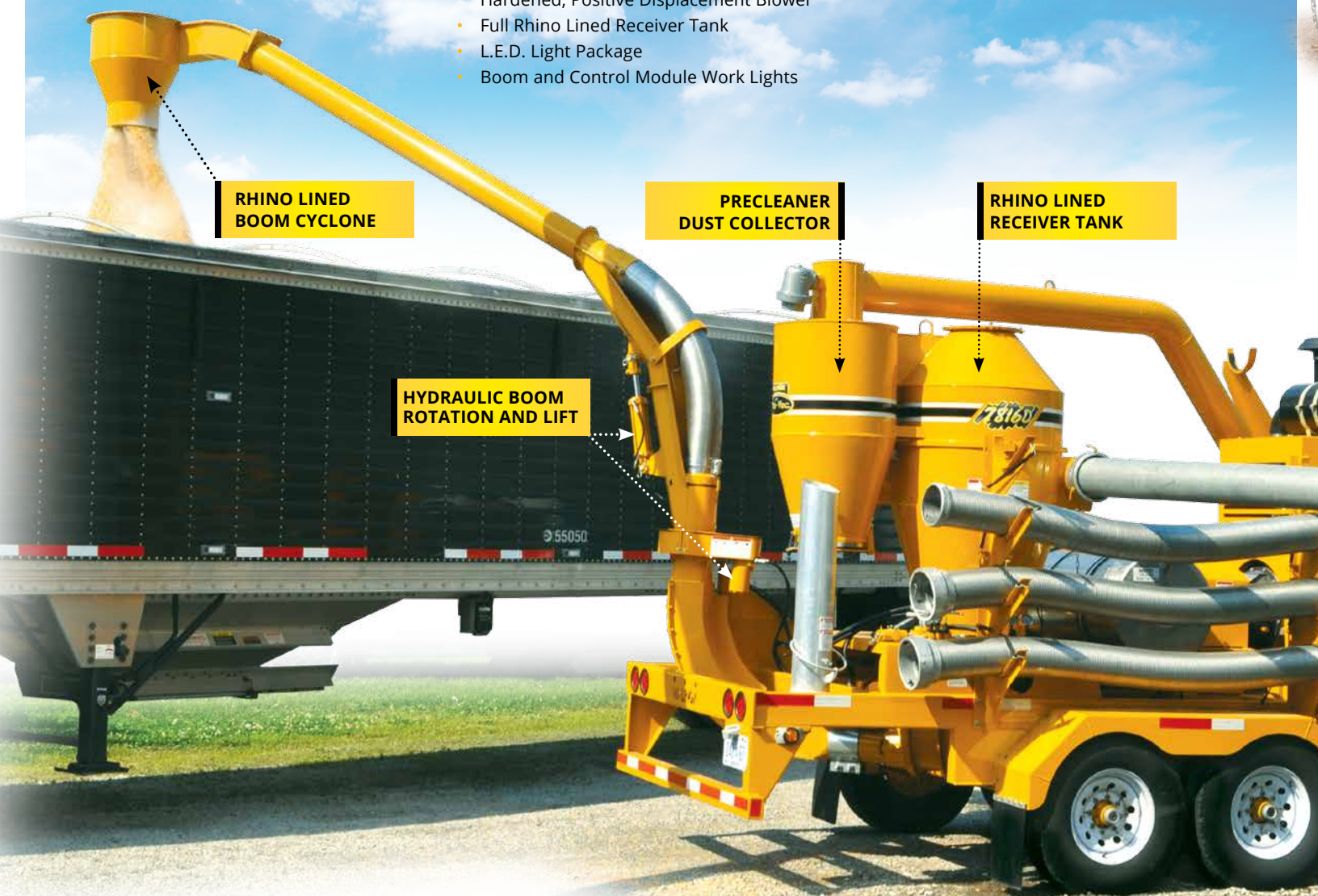
RHINO LINED BOOM CYCLONE