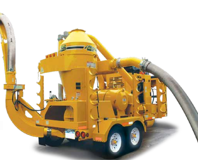
Floor Sweep Nozzle