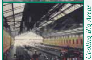
Cooling Big Areas