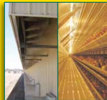
The PolAIR HP Fog System is ideal for layer and floor birds!