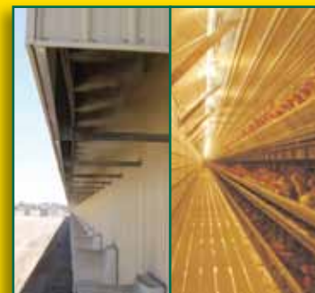
The PolAIR HP Fog System is ideal for layer and floor birds!