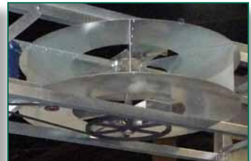
Note: Protective cage removed to show product.

Call your local VAL-CO representative or distributor for more information on these and our other fine products.