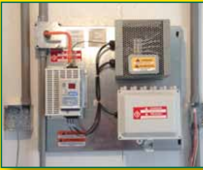
VFD Controls for variable speed operation