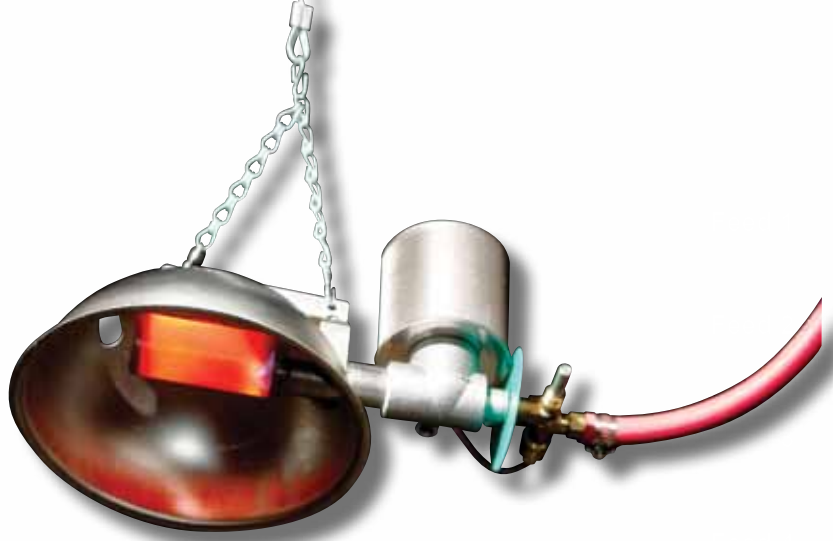
The M2 Infrared Heater with Standard Filter.