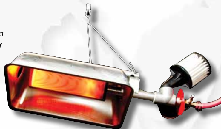
The M8 Infrared Heater with Heavy Duty Filter