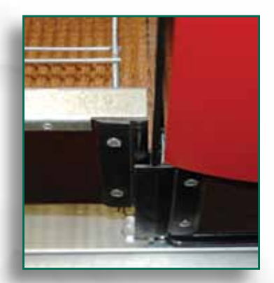
With slide together components, assembly is simple.