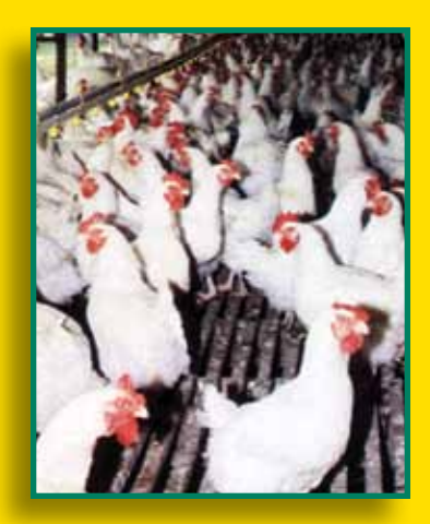
VAL-CO<sup>®</sup> can supply vou with Floor Watering & Feeding to help complete your system.

The VAL-CO Family of products provides all your equipment needs.