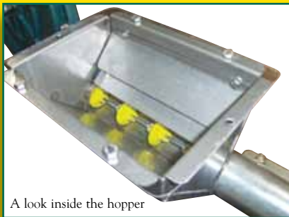
A look inside the hopper