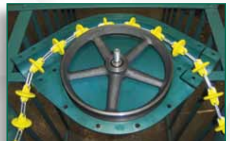
Opened corner unit with chain