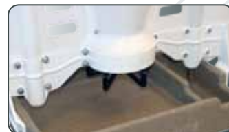
Version 4: Maximat Weaner Poly