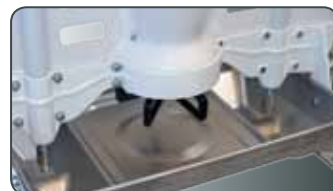
Version 3: Maximat - Wean-to-Finish 7-130kg